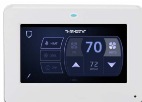
7872-W | 7873-W | 9862-W | 9862USB-W