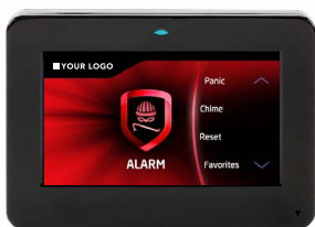
7872-B | 7873-B | 9862-B | 9862USB-B