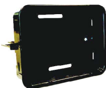
695-7800-B In-Wall Kit or 695-7800-W