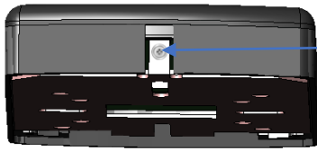
Screw or pin-in-torx

Install the #4-40 screw or pin-in-torx at the bottom of the reader.